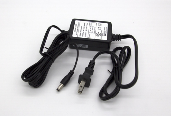
CRT-149 Charger, 120VAC to 12 VDC for CRT-12V & FLT-DC12 (Barrel Type) Serial# above 20062416