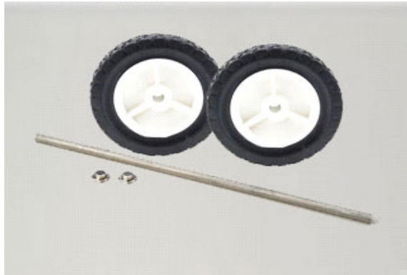
INJ-677 Wheel Kit for INJ-MINI, CRT-12V & FLT-DC12 carts