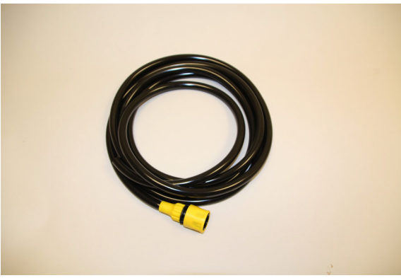
CRT-070 Output Hose 12' with Quick-Connect fitting