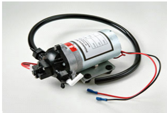
CRT-040 Pump, 12 VDC, with Clamps and Elbows