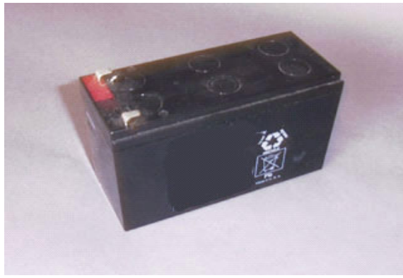
CRT-095 Battery, 12 VDC