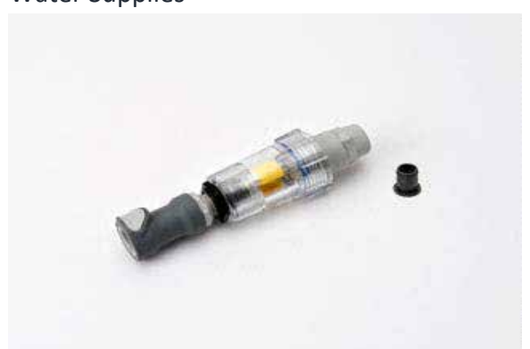
FLT-071E Replacement Front End for Stealth Water Supplies (BWT™ compatible)