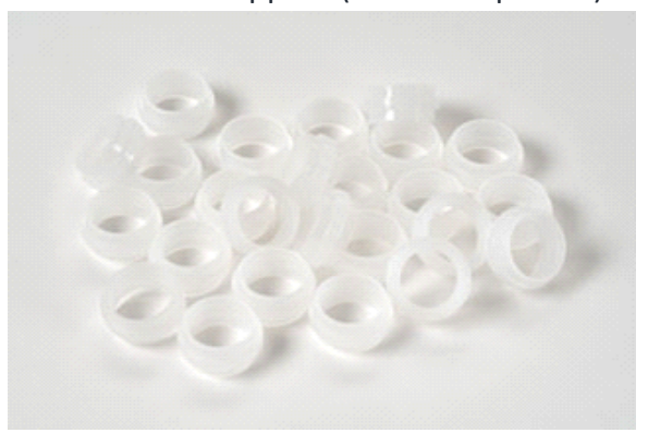
INJ-608 Collars for Water Injectors & Stealth Systems (25 Pack)