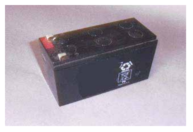
CRT-095 Battery, 12 VDC