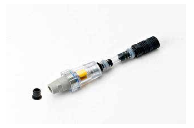
FLT-071A Replacement Front End for Stealth Water Supplies (BFS™ compatible)