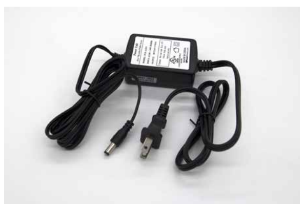
CRT-149 Charger, 120VAC to 12 VDC for CRT-12V & FLT-DC12 (Barrel Type) Serial# above 20062416