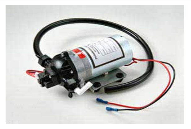
CRT-040 Pump, 12 VDC, with Clamps and Elbows