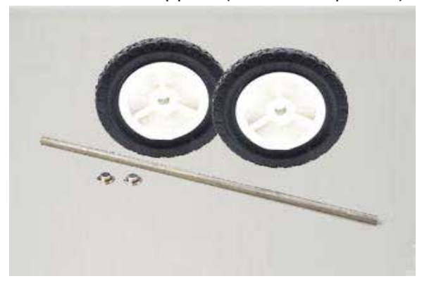
INJ-677 Wheel Kit for INJ-MINI, CRT-12V & FLT-DC12 carts