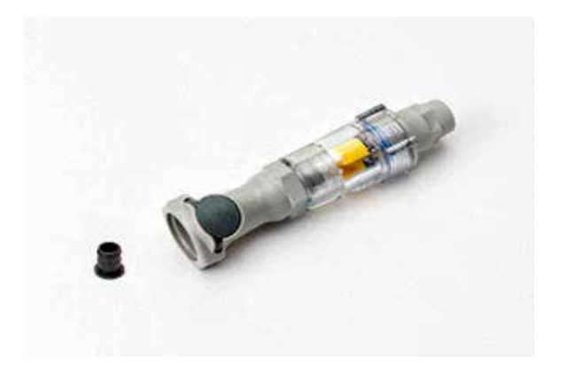
FLT-071 Replacement Front End for Stealth Water Supplies