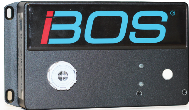
iBOS Basic Controller

–The built-in alert system can also be used to diagnose potential equipment faults. When the alarm sounds, you can identify the location of the mispick by pressing the white button on the iBOS Basic Controller. The blue LED of the Sentinel where the mispick occurred will flash for 20 seconds, then return to normal mode. This feature can also identify loose battery connectors if they are the source of the mispicks.